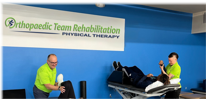
Facilities are spacious and clean. Equipment is well-maintained. Staff is well trained and experienced.